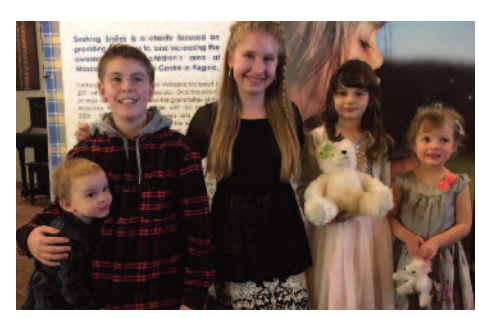
Teddy Bear Tea: $19,000