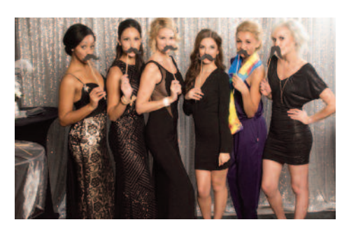
The Moustache Bash: $25,000

INTERESTED IN HOSTING YOUR OWN FUNDRAISER? CONTACT US TODAY: HRF@HRF.SK.CA OR 306.781.7500