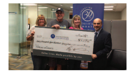
Pipeline of Dreams Golf Tournament