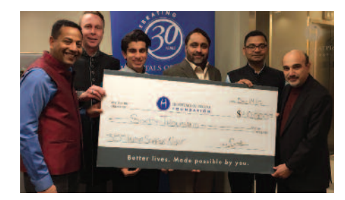
India Supper Night