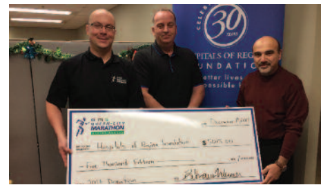
Queen City Marathon