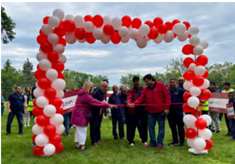
BAPS Charities Walk/Run

The giving spirit of the individuals, organizations and businesses that support Hospitals of Regina Foundation is outstanding. Time and time again, these caring and generous partners gather together to raise funds for Regina's hospitals and health care facilities in new and exciting ways. Whether a gala event, a donation at the till campaign, a golf tournament or a marathon, our community steps up to support health care for those who need it most. The Foundation is so grateful for our community's support because nothing we do happens without you.