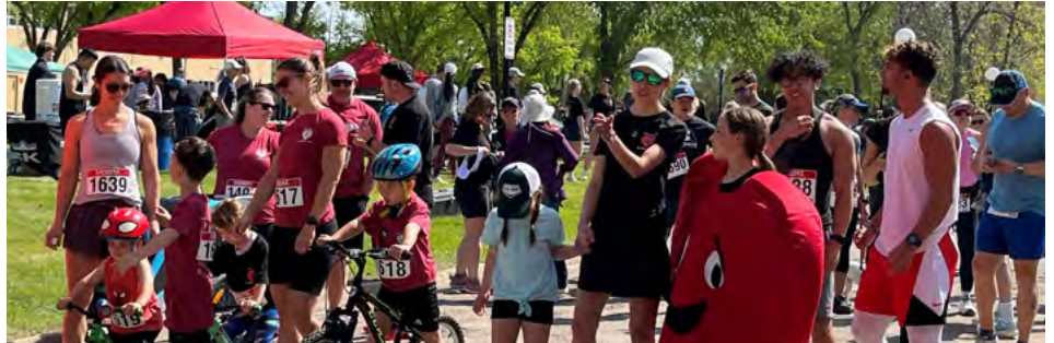
Cardiac Care 5km Walk/Run