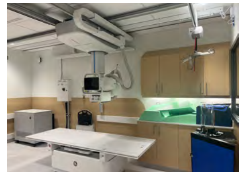
An X-ray room inside Regina's Urgent Care Centre