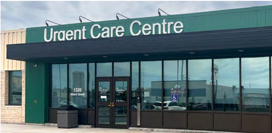
Regina's Urgent Care Centre

Until recently, people with non-emergent medical issues in Regina often had no other option than a trip to the emergency room at one of our hospitals. As a result, emergency rooms faced capacity challenges and patients endured long wait times.