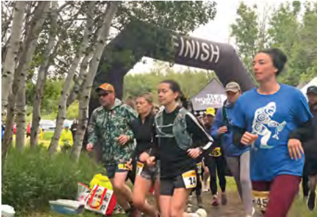
Bigfoot 50 Trail Run