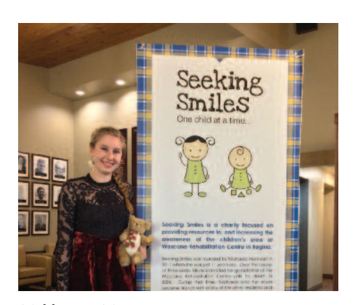
Teddy Bear Tea